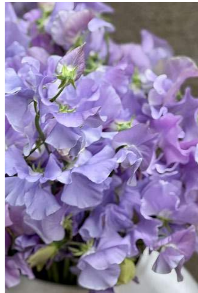
Spring Sunshine Light Blue 2251F Enchanting early flowering multiflora Spencer type in a pretty shade of pale sky blue. Ideal as a cut flower.

A nostalgic, cottage garden classic with the most captivating fragrance and a quintessential charm. Heavenly scented, simple, blooms in a wide range of colours and varieties, from heavily perfumed heirlooms with delicate flowers, to modern, long-stemmed types, perfect for bouquets and vases.