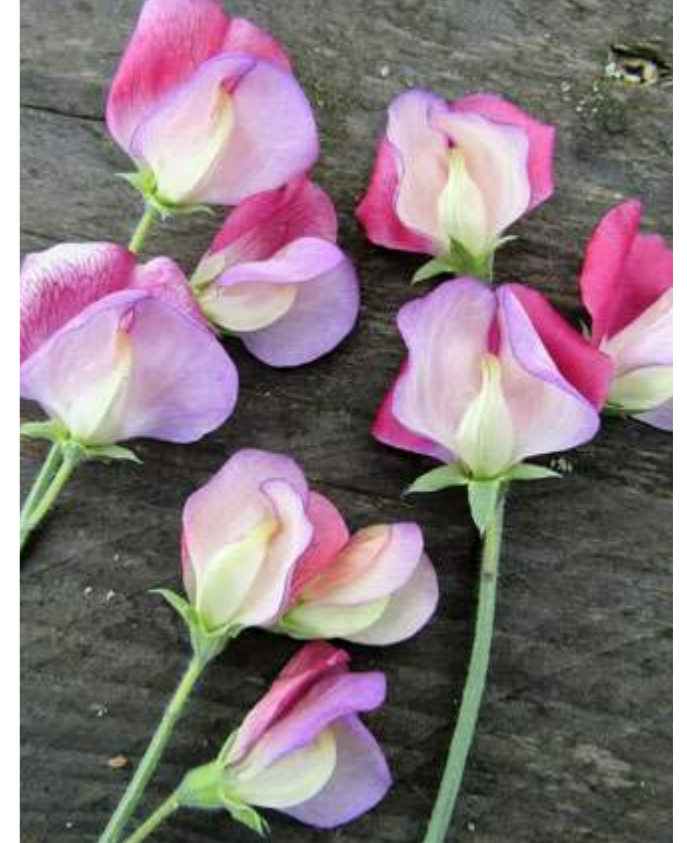
Fire & Ice 2263F A fascinating combination of colours with a picotee edge and an intense perfume. £2.95 20 Seeds