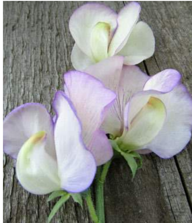
April in Paris 2263E Pale cream ruffled blooms edged in lilac on long cutting stems with the most intoxicating perfume. £2.95 20 Seeds