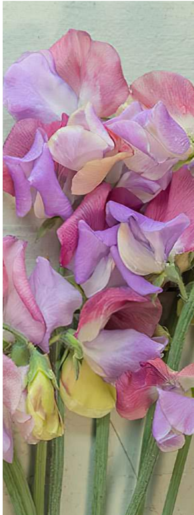
Enchante 2253A Delicately furled cherry-rose, cream and light lavender blooms on sturdy cutting stems, bred by Dr Keith Hammett £2.75 20 Seeds