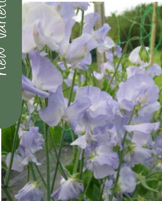
Alison Louise 2244D A multiflora variety, producing five or more steely blue flowers on each long stem. HA £2.95 10 Seeds