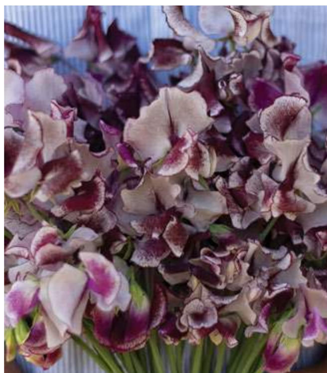
Wiltshire Ripple 2254 Pure white frilly flowers with rich claret ripples maturing into chocolate as the flowers age £2.75 20 Seeds