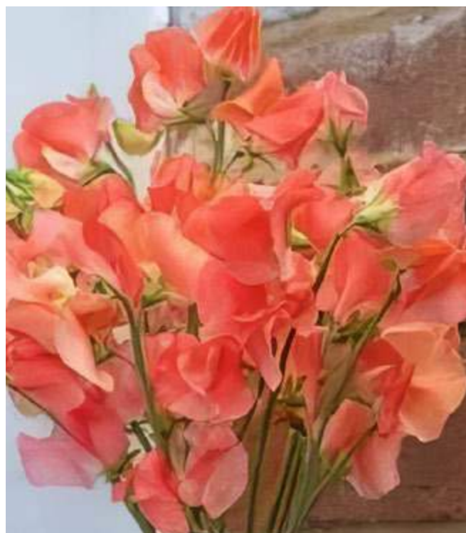
Maloy 2244L Delightful apricot and soft orange-pink flowers with as many as seven blooms per stem. HA. £2.95 10 Seeds