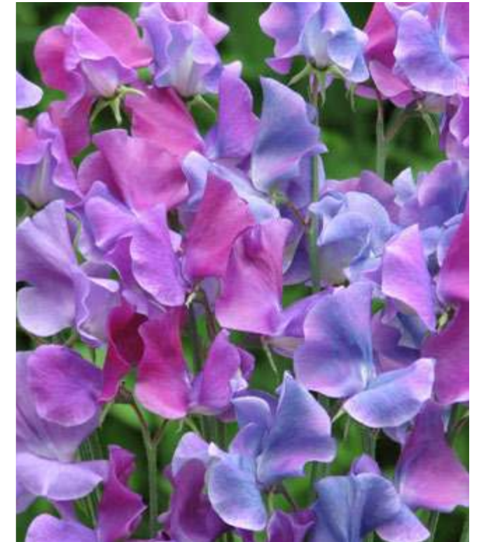
Duchy of Cambridge 2253B

Blooms open as mauve, but gradually change to turquoise and ultramarine shades. HA