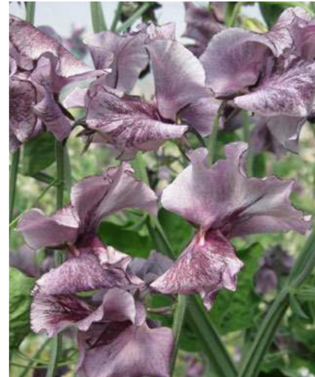
David Tostevin 2245

Named in honour of our founder. Unusual, dappled blooms in an eye-catching smoky lavender grey,