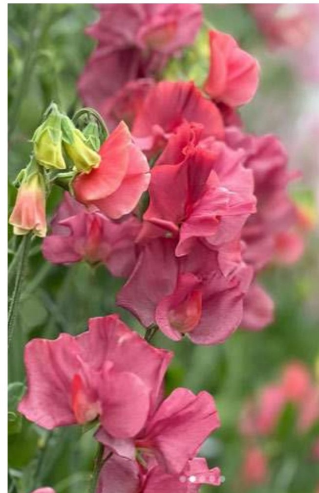
Kings Ransom 2266D A runaway success last year and probably our fastest selling Sweet Pea ever, King's Ransom is a truly magnificent variety with a delightfully aromatic, fragrance and captivating, dusky colouring that changes as the blooms mature. £3.95 10 Seeds