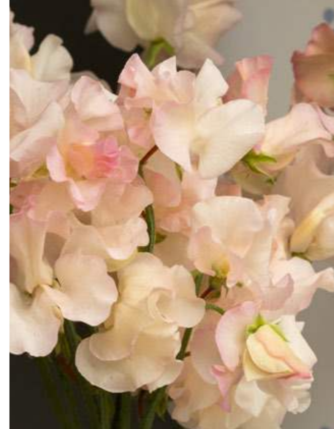
Monarch's Diamond 2252G A lovely variety in warm rich cream tones with a diffuse, soft rose-pink picotee edge. £2.95 10 Seeds