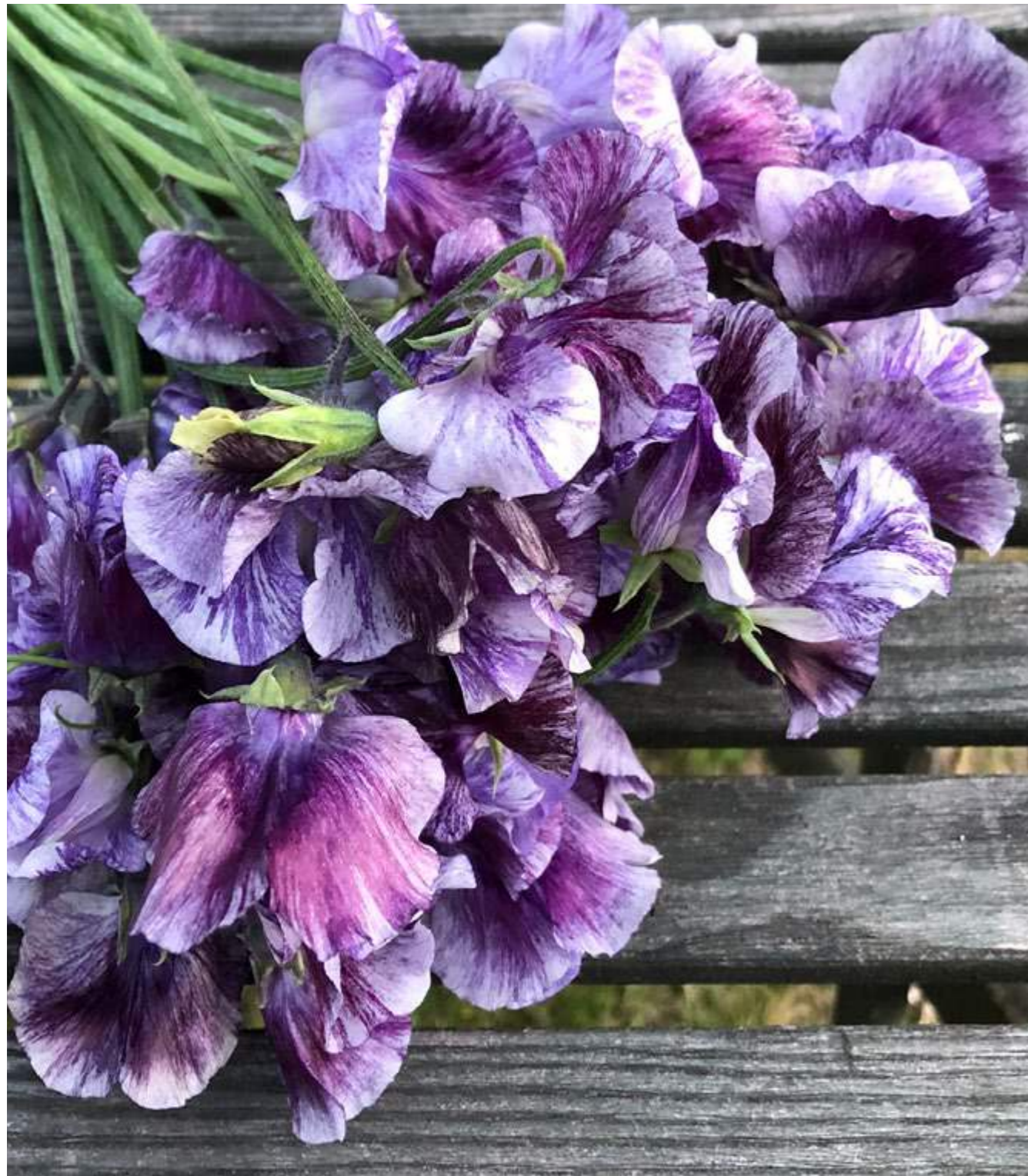
Earl Grey 2246F

An eye-catching variety, Earl Grey is a large flowered Spencer type with two tone flaked petals, bred by Dr Keith Hammett from New Zealand. The most beautiful maroon-purple flaked petals gradually fade to grey and the blooms are blessed with the most delicious scent. Flaked varieties have colour on both sides of the petals that radiate from the middle out to the edges.