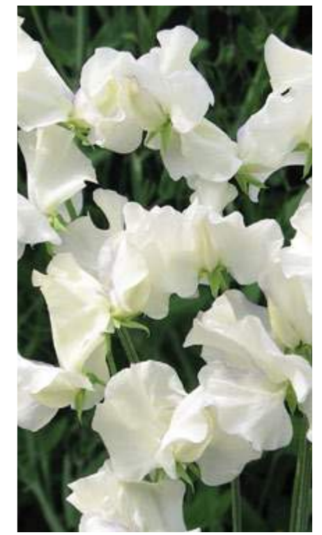
Old Times 2258D

Frilly creamy white blooms, delicately tinged with mauve along the edges of the petals. HA