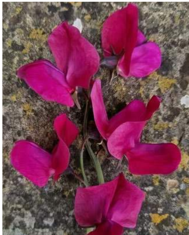
Ruby's Gown 2244M Stunning in any garden setting. Well scented with notes of rose and honey. HA £2.95 10 Seeds