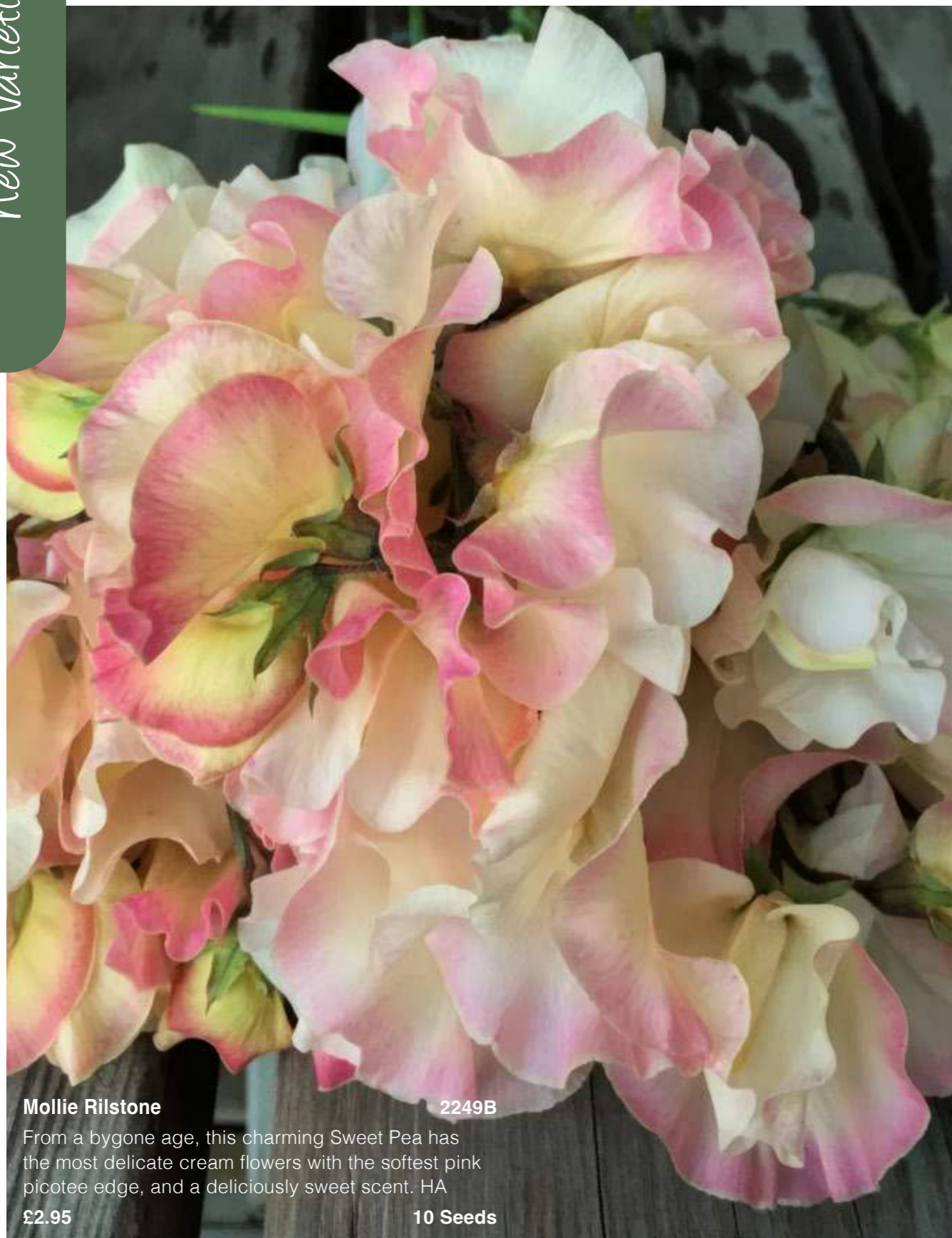
Mollie Rilstone 2249B From a bygone age, this charming Sweet Pea has the most delicate cream flowers with the softest pink picotee edge, and a deliciously sweet scent. HA £2.95 10 Seeds