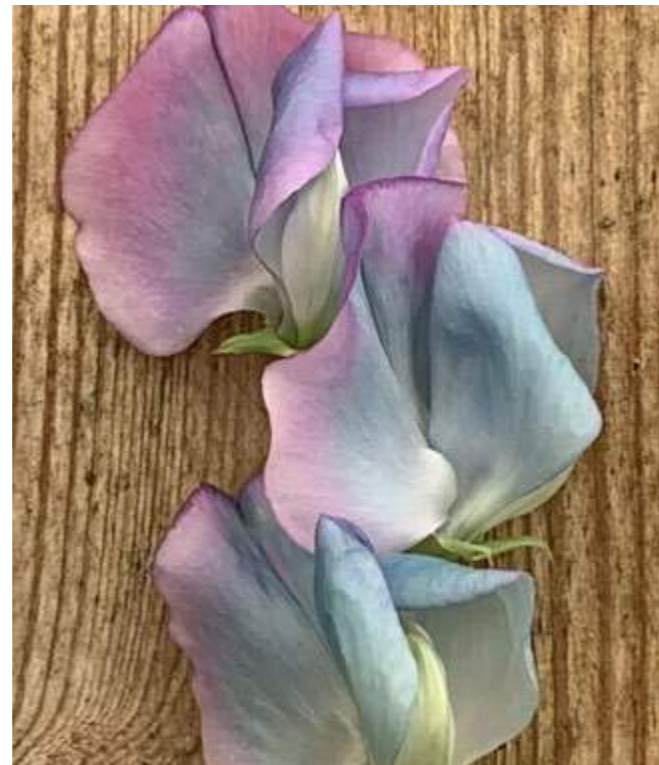
Turquoise Lagoon 2263G A fascinating colour, the early blooms open lavender-pink, then morph through purple, pale and iridescent blue to turquoise as the flower ages. £2.95 20 Seeds