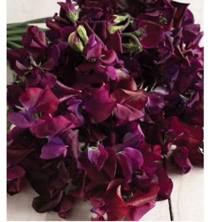
Midnight 2255 Dark, dramatic chocolate-maroon coloured blooms on long cutting stems. £2.75 20 Seeds