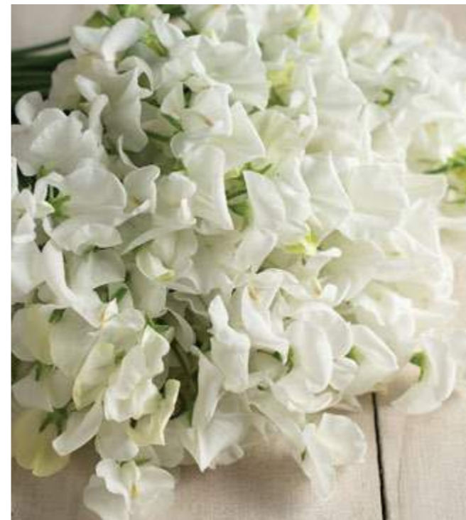
Royal Wedding 2258 Elegant slightly ruffled pure white blooms with just a hint of cream on long cutting stems. £2.75 20 Seeds