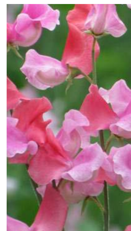
Salmon Duo 2261H An award winning Sweet Pea with sweetly scented bi-coloured pink and salmon-red blooms. HA £2.75 20 Seeds