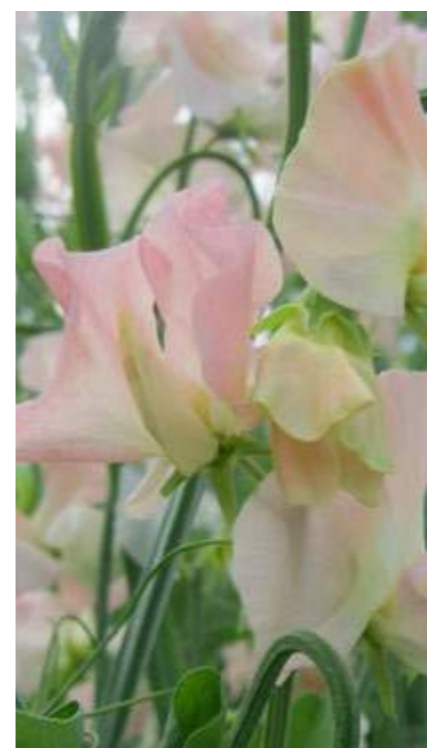
Castlewellan 2264E The softest, pastel peach frilly flowers on long stems, with a long flowering period. HA £3.50 10 Seeds